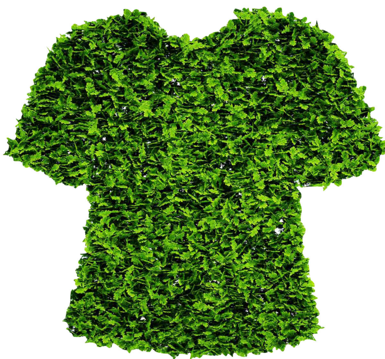
MBS Group, 2018