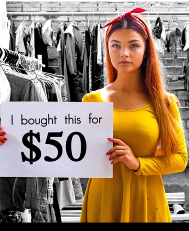
Ethical Fashion, 2018